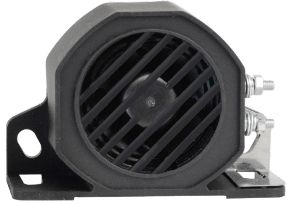
777079S New Version