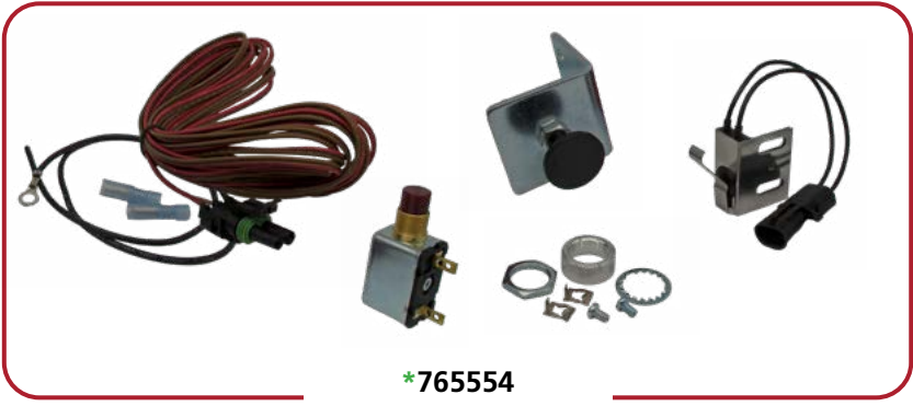
*765554 Compact-Style Switch Kit