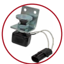
Plunger Switch For Heavy-Duty applications