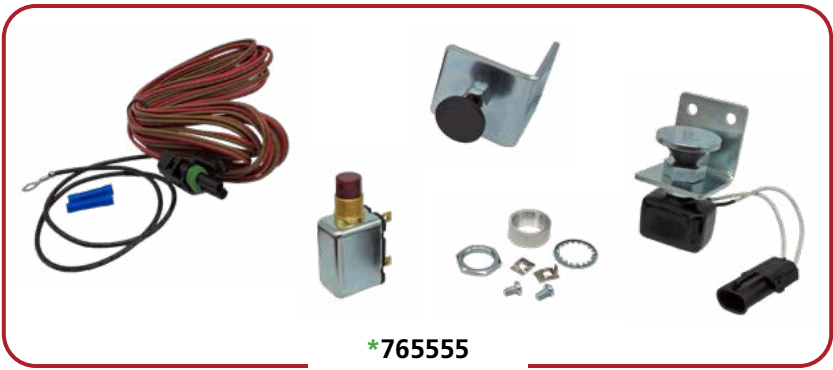
*765555 Plunger Switch Kit