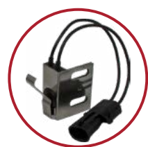
Compact-Style Switch For Light to Medium-Duty applications or for applications where space is limited